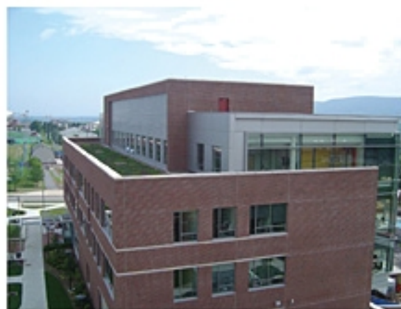
■ Penn State Health & Counseling Services Building