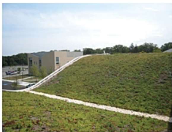
■ Georgian Court University Wellness Center